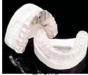
The Tap II

A potentially serious medical condition, sleep apnea, the temporary absence or cessation of breathing, increases the risk for cardiovascular disease or stroke. “Comprehensive diagnostics are critically important in determining the crux of the problem and the ideal treatment course for each individual patient,” states Neil F. Sachs, DMD, who is the first and only dentist in the Coachella Valley offering the new Tap II® (Thornton Adjustable Positioner). Dr. Sachs, who specializes in diagnosing and treating sleep apnea, TMJ (temporomandibular joint or jaw joint) disorder and orofacial pain, says the Tap II is up to 96 percent effective in the treatment of sleep apnea. The Epworth Sleepiness Scale